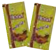
MIXED Fruit Jam