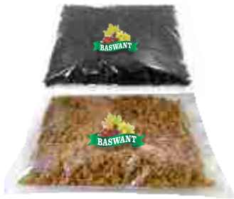
Nitrogen seal Pack